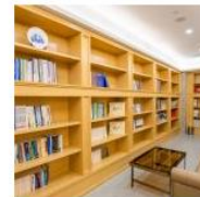
Front Desk Area