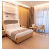
Superior Single Room