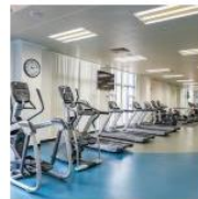
N1 Fitness Room